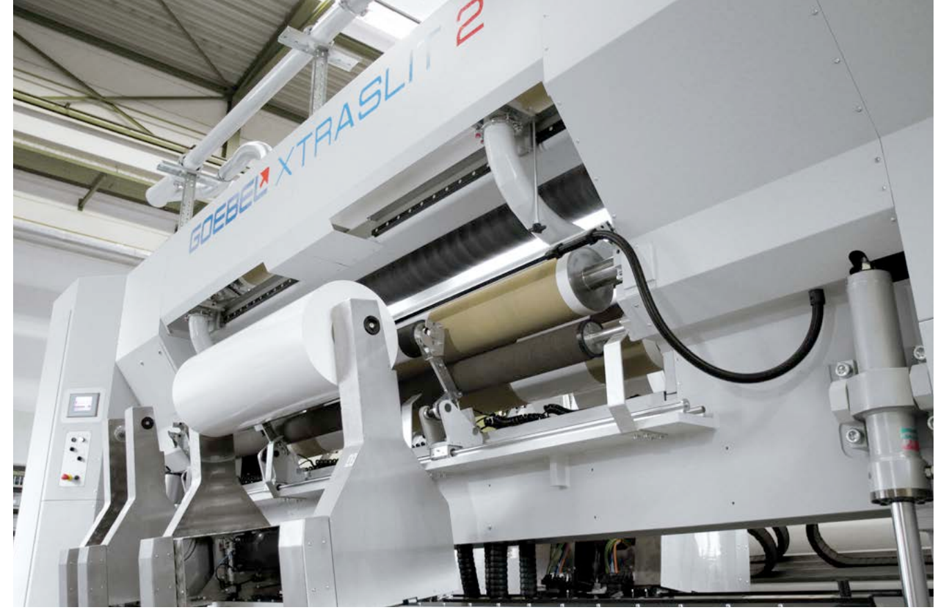
The GOEBEL XTRASLIT 2 is an innovative slitter rewinder and sets standards for highly productive processing of paper, film and foil, and flexible packaging materials.