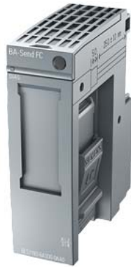
SIMATIC ET 200SP, BusAdapter BA-SEND BA1XFC, 1x FastConnect connection for ET connection