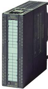
SIMATIC S7-300, Digital input SM 321, isolated, 16 DI, 24-48 V AC/DC with single rooting, 1x 40-pole